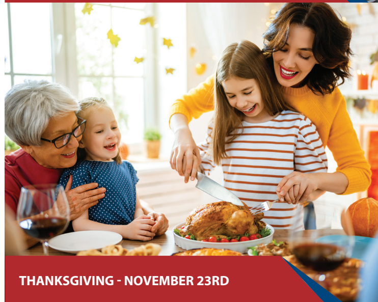
THANKSGIVING - NOVEMBER 23RD