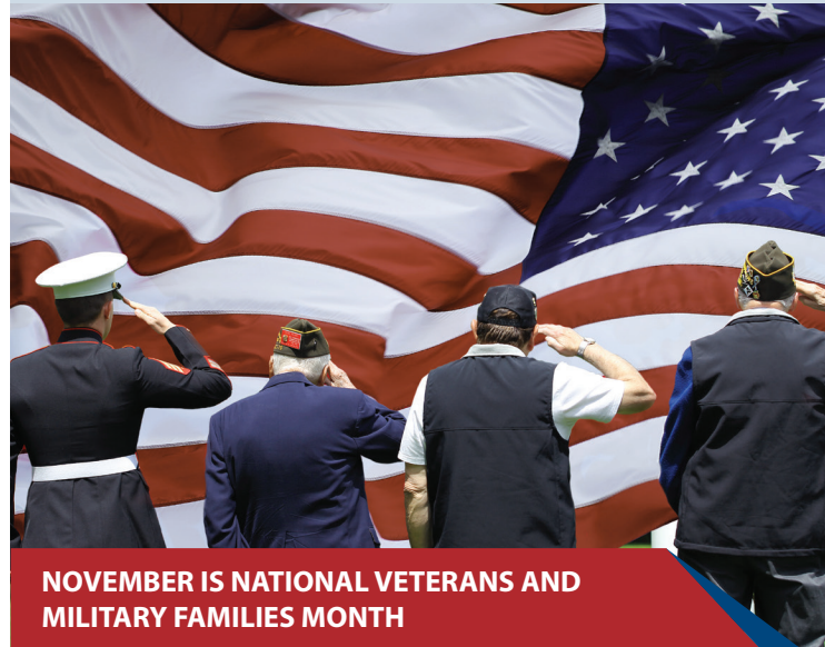
NOVEMBER IS NATIONAL VETERANS AND MILITARY FAMILIES MONTH

Showcase your best chili recipe for a chance to win a slow cooker! Join us November 10th, from 4:00 PM to 6:00 PM at the Welcome Center to participate. Open to only on-base Robins Family Housing Residents.